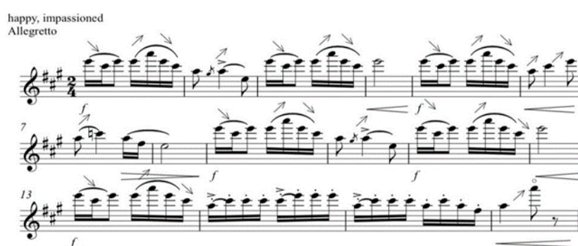
Figure 9 the Music score from “Dance song”

of the Miao Feige. This requires not only the accuracy of the sound that quickly transforms the position in the high-span sound area, but also make sure the Glissando natural performance. At the same time, in order to better express the freedom and strength of the dance in the music, this section is almost all the whole bow performance except for the last three bars. At the end of the song, the violin quickly rushed to the top of the overtone, which imitates the habitual shouts of the singers at the end of the Miao Feige, showing the joy and confidence of the Miao people, and well showing the crisp and agile character of the Miao people (see Figure 9).