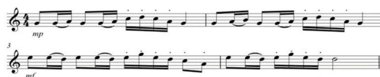
Figure 7 the Music score from “Labor Song”

To show the expression of the labor field scene, we created and adapted a “Labor Song” according to the Miao folk song tune in southeast Guizhou province and the Miao song "Drunk Miao Township". The piece of music is mainly divided into two parts: section 1 to 8 is the first part, and section 8 to 22 is the second part. The first part is mainly to show the scene of the Miao people's work, and a melody with a strong rhythm is selected for the music. The tune is inspired by the Miao folk songs in southeast Guizhou province. This tune is often used by young men and women to play, tease each other, or praise, but the rhythm is relatively slow. But here we adjusted the rhythm a little faster, set to 80 / minute, first to match the speed of labor hoe, and then this speed is easier to show the sense of power when labor. For this reason, the violin changed the lyrical way of playing the bow before by hitting the bow, and the lower part of the bow is selected near the root of the bow. The notes played are full of power and crisp. In this way, the whole music is not only full of rhythm but also full of power. The listener can not only feel the strength and firmness of the working people when they work but also feel the vigorous vigor and exuberant energy of the young people. In the background of the music, the boys’ performance of the "hoe" in the eyes of the audience suddenly vivid up (see Figure 7).