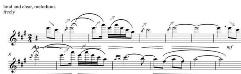
Figure 10 the Music score from the ending

In the ending, the traditional theme of Miao Feige appears again. At the end of the performance, the Miao Feige is played the same as at the beginning again. The whole work echoes at the beginning and end, alternating between morning and night. Different from the beginning, the performance is more quiet and calm, the music slowly ends in a peaceful life, describes the quiet, and people return to their homes to sleep, which also indicates that a new day is coming... (see Figure 10)