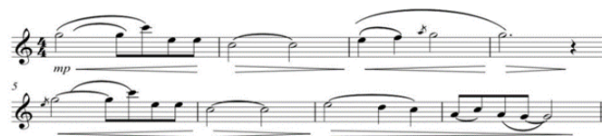
Figure 5 the Music score from "Youfang song"