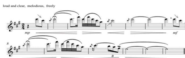
Figure 4 the Music score of Miao Feige

In the introduction, violin Solo Miao Feige depicts the beautiful scenery of Miao village in the morning. The violin played clean, clear, and bright as if the sun shone through the leaves in the morning. With music describing the Miao village in the sunrise east, everything is awakened by the sun thriving scene beautiful scene. The bamboo flute is joined, and the violin plays alternately, changing the Miao flying song, just like the singer singing, the rhythm is freely relaxed. The Feige is one of the most characteristic tunes of Miao music. As long as the Miao Feige rings, the audience seems to be in the Miao ridge in the morning, as if to hear a beautiful Miao girl, is gently waking up the sleeping mountain with her beautiful song (see Figure 4).