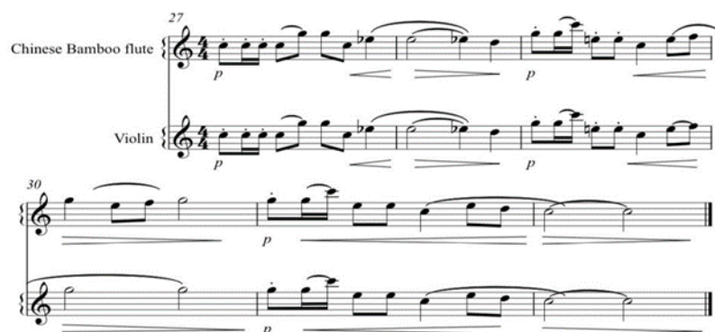
Figure 6 the Music score from “Youfang song”