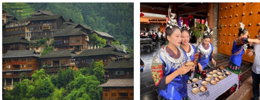
Figure 1 the Life of Miao people

To conduct a deeper study on Miao customs and culture, the researchers also conducted field visits to Qian Tao Miao Township, Huaxi District, Guiyang City, Guizhou Province; Jianshan Miao Village, Jianba Town, Suiyang County, Zunyi City, Guizhou Province; and Shibing County, Qiandongnan Miao Autonomous Prefecture, Guizhou Province. Respect for the current Miao life status, customs, culture, music, and other aspects of the in-depth understanding.