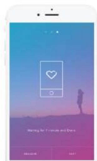
3. Measure the heart rates