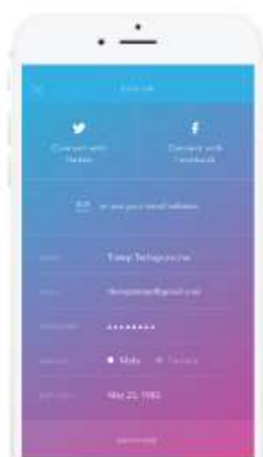
2. Log in