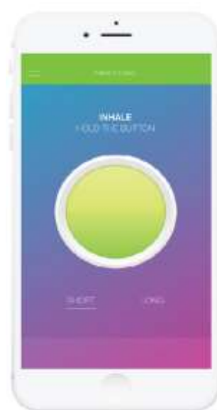
6. Choose between long or short breathing