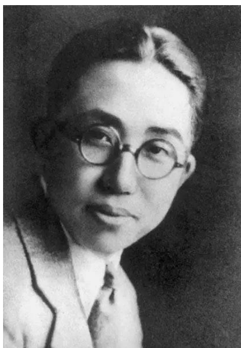
Figure 1.1 Huang Zi

Huang Zi (1904.3.23-1938.5.9), a famous modern composer and music theorist in China, the founder of early music education in China, was the first to systematically and comprehensively teach modern European and American professional composition theory to domestic students (Wang, 2015).