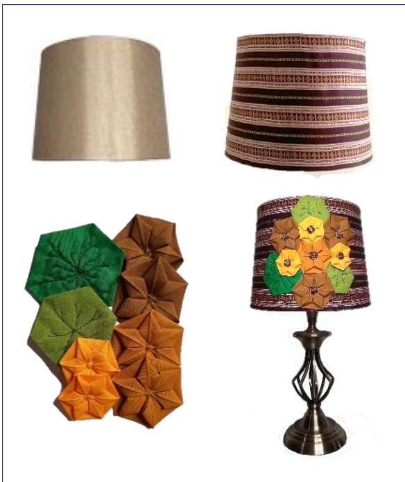
Figure 10 Lampshade product from Sukhothai fabrics weaving with original origami techniques

3. The satisfaction of the sample group of 50 people towards the prototype product were analysed by using statistics of frequency, percentage and mean was found that most of the respondents are 64 percent female and 36 percent male. Most are in the age of 40–49 years (40%), and the age between 30–39 are 24%. Most of them graduated in Junior High School (26%) and 22 % graduated in Junior high school, high school and vocational certificate. For the occupational information, most of them work as farmers ( 28 % ) , followed by housewives ( 26 %)The satisfaction assessment of lampshade from Sukhothai fabrics using the origami techniques are shown in Table 1