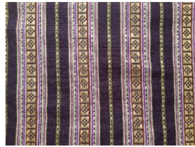
Figure 1 Example of Pearl Pattern fabric

The researcher then came up with the idea of using Sukhothai woven fabrics to design lampshade products in order to develop them to have a contemporary design using Japanese origami folding techniques to decorate and creating a unique look from the existing designs. The decoration with various styles of folding and placement makes the lampshade products more modern. It is also a guideline for creating products development of Thai handicrafts and making that products to be persistent.