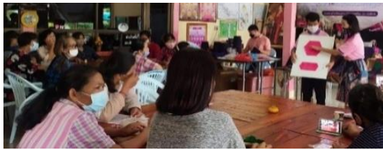
Figure 4 Study of lampshade product model from Sukhothai woven fabrics with origami techniques

2. Design of Sukhothai lampshade fabric using origami techniques. Researcher have identified one table lamp style, 48 cm. wide and 72 cm. high. The researcher designed the idea of laying the fabric into 2 patterns: horizontal laying pattern and vertically laying pattern and there are 7 types of origami techniques including origami folding into a hat pattern, a six-petal flower, a four-petal flower, a turbine, a carp, a goldfish, and a rabbit. There are 3 types of decoration styles, including arranged in a row, group overlay and a balanced arrangement on the bottom. Then ask 5 experts in sewing and design.