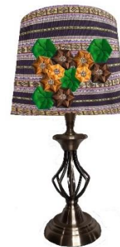
Figure 8 Draft ideas based on expert recommendations