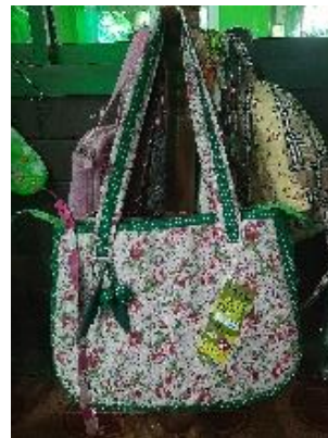
Figure 3 products from members of the Sewing and Art Community Enterprise Group.