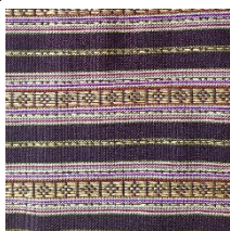
Figure 5 Horizontal laying pattern.

The results are as follows. Most experts agree that laying out the horizontal pattern makes the lamp appear larger and feel more relaxed. All experts think that a six-petal origami folding pattern is appropriate because it resembles a lotus flower which is the provincial flower of Sukhothai province. And may be decorated with bright flowers which have the same color as the cloth used to cover the lamp with an arrangement of light colors to darks colors and decorated with lotus leaves stitching to make it look realistic. In terms of decoration patterns, most experts agree that group overlay pattern are appropriate because of their natural composition. The researcher had summarized and improved ideas from experts according to recommendations as follows: laying the fabric pattern horizontally, a prototype of the lampshade product made from Sukhothai fabrics using the origami techniques should be folded into a six-petal flower pattern, use a fabric in the same color as the fabric used to cover the lamp, stitching lotus leaves by choosing light and dark colors and arranged in group overlay style.