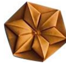
Figure 6 A six-petal origami folding pattern