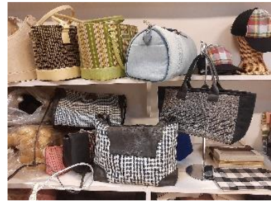
Figure 2 Examples of products from Hat Siaw woven fabrics