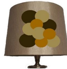
Figure 7 Design of Sukhothai lampshade product using origami techniques.