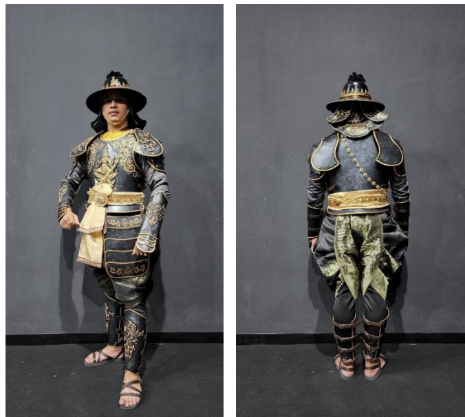
Figure 5 King Naresuan the Great dress

The top is wearing a long-sleeved bra. There is a short-sleeve outer layer over the top layer without armour. Covered with steel, put on the neck strainer, and put on the lower part of the shaft or panties. There is an outer layer of steel armor over another layer. The elements of the dress are as follows:-