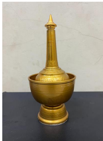
Figure 7 Phra Suwan Phingkan

The ewer, water pot or Phra Suwan Phingkan. The cauldron was made of gold in the image of a lord, a usable container. It is a royal amulet for the King, used as an accompaniment to the rank of the prince in the front. It was a vessel made of engraved gold for serving drinking water, it had a tall shape. The base has a base to support the master's spherical shape, high neck with open lid covered on top to make a top layer of prickly pear with a gold necklace fastened to the cauldron's neck.