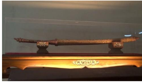
Figure 6 Phra Saeng Sword Somdej Phra Naresuan the Great

The ewer, water pot or Phra Suwan Phingkan. The cauldron was made of gold in the image of a lord, a usable container. It is a royal amulet for the King, used as an accompaniment to the rank of the prince in the front. It was a vessel made of engraved gold for serving drinking water, it had a tall shape. The base has a base to support the master's spherical shape, high neck with open lid covered on top to make a top layer of prickly pear with a gold necklace fastened to the cauldron's neck.