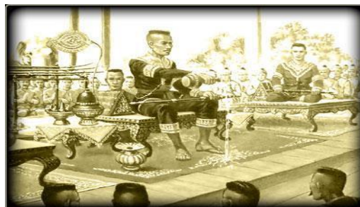
Figure 3 King Naresuan performs the ceremony of pouring out Thaksinotok to the gods, heavens and earth to know to declare independence.

Concept and inspiration , the ideas and inspiration for creating the show, King Naresuan declares independence came from the recognition of the importance and glorification of the Thai king who bravely restored the freedom of the nation. Until he was honored to be a king in the history of Thailand, one of them and only a blessing only.