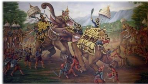
Figure 2 King Naresuan song yutthahatthi (war elephant) who sacrificed their lives for the nation.

of the Kingdom of Thailand expansive since the whole of Southern Burma, that is, from the western Indian Ocean to the shores of the Pacific Ocean on the east side, on the south side, all the way to the Malay Peninsula. On the north side, it is always on the banks of the Mekong river and also including some of the great Thai states, he has waged wars in the country that is an enemy of Thailand in every direction until Thailand is at peace without war for a long time. All his great and small duties for the benefit of the country and all Thai people throughout his life. In the battlefield and in the countryside all the time, he was not spared, even when he died, he died while marching on the ground. The Enemy of Thailand counted that he had renounced him completely for the nation, it deserves that the Thai generation. Later, realized his great grace and remembered his deeds honored above for a long time.