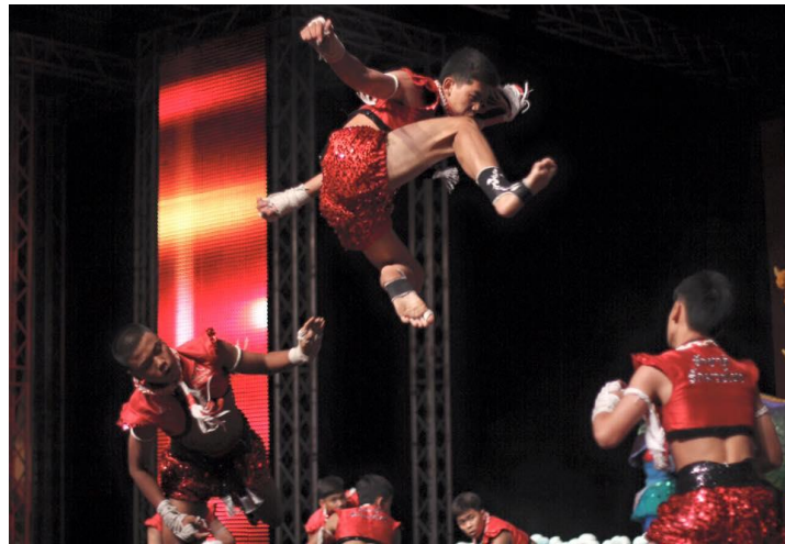
Figure 6 Muay Thai dance performance in Thailand

3. Presentation style. Throughout the 12 years of the creation of Muay Thai dances, the presentation format in each year has been creative and has a common characteristic, namely bringing local stories or Thai phrases to present, such as Phran Boon-Jap, Kinnaree or historical stories. For example, the legend of the battle of King Naresuan is presented as a form of presentation. In order to make the show look easy to understand, from 2011 onwards, it was found that the scene was used to accompany the performance and other equipment in addition to adding to the most complete form of Muay Thai dancing as well.