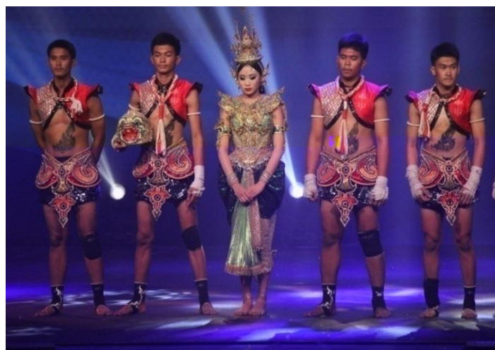
Figure 4 Thai boxing dance costumes

1. Muay Thai equipment in the dance: Another important element is the costumes. The costumes of Muay Thai dancing are similar to Muay Thai, which the performers must wear. They are:- 1. MongkonSisa (a garland on head), 2. Prachied (an inscribed cloth on arms), 3. Hand wraps, which are considered compulsory equipment. But in the show, the form of hand wrapping has been modified to be a sleeve. The shirt will look like a sleeveless shirt with a stand-up collar and a cut in the front, short torso (cropped waist), and Oloincloth or pants There is a pattern sewn into the pants, but the loincloth is concise in order to facilitate the movement of the show because it requires fast movements. If the design is too tight, it may cause the costume to tear during the performance. There is a cloth tied at the waist by the Muay Thai dancing costume in addition to the above mentioned. The waist tie is another item in an outfit that can be tied in many ways according to the design of that dress. It was found to tie a single piece of fabric and two pairs of pieces to create contrasting colors, such as black and red, white and black, gold and red to complete the outfit.