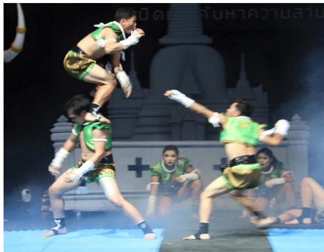
Figure 2 Creative boxing moves

4. Creative boxing posture, the creative boxing posture in Muay Thai dance competitions, are the adaptations of boxing postures to create more creative weapons. For example, from the original posture of releasing any actions in Muay Thai, for example, straight punching before action, there may be a backflip and then punching, or connecting and going out to make gestures on the mezzanine, etc.