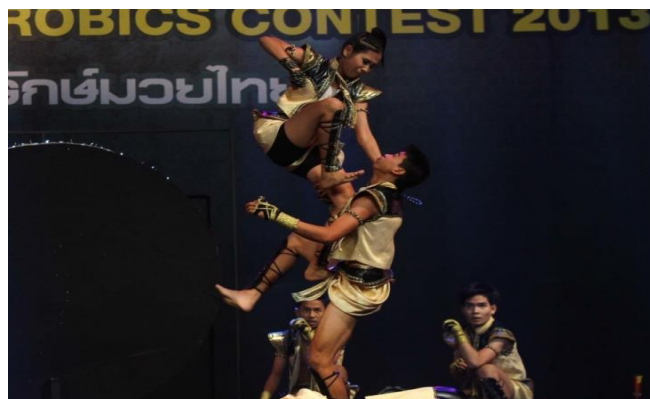
Figure 3 Strength in performing Muay Thai dancing poses

5. Strength in performing postures, Muay Thai dancers or successful teams besides the new boxing postures. Another important thing is strength in performing strong Muay Thai postures, clear in the deployment of action and the execution of the perfect stance.