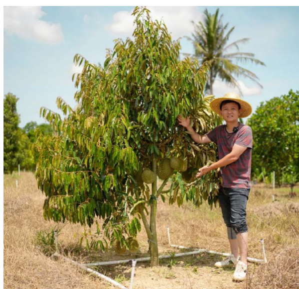
Figure 2 : Dwarfing cultivation of durian

To achieve consistency in practicality and aesthetics, in line with the current development trend of packaging design, the demand for packaging design should not only achieve moderation in design, but also meet the aesthetic requirements of consumers, adapt to the needs of the consumer market, and promote the realization of economic and social benefits. Design and produce based on the principles of practicality and aesthetic consistency, in order to meet the requirements of consumers.