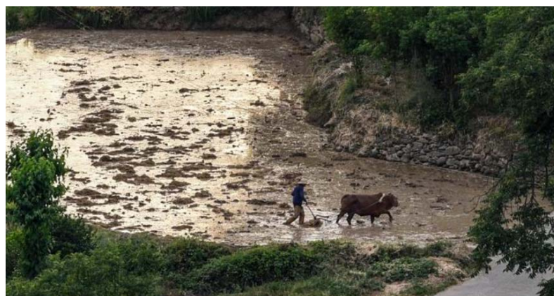
Figure 1: The terraced fields of Ankang Fengyan, as an agricultural cultural heritage, have been destroyed.

Due to different regions, the development and management methods of China's agricultural cultural heritage also vary. Adaptive management refers to the protection and management of agricultural cultural heritage tailored to local conditions, which is also an important requirement for the protection of agricultural cultural heritage. Agricultural cultural heritage mostly exists in backward, remote, and relatively poor natural conditions areas. These agricultural systems are well adapted to the local special environment and are small and scattered. Due to the different environments in which agricultural cultural heritage exists, the methods of protection and management are also different. In the long-term historical development, residents of agricultural cultural heritage sites have provided a foundation for adaptive management of agricultural cultural heritage in resource poor environments. In addition, the dynamic protection and adaptive management of agricultural cultural heritage are inseparable, and different dynamic protection measures should be considered based on the actual local situation. At the same time, adaptive management of these systems can better achieve the protection of agricultural cultural heritage.