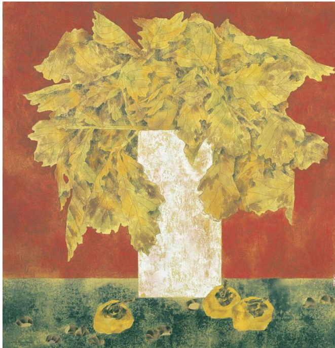
Figure 4. Tang Xiuling's "Autumn Scenery"

Painter Tang Xiuling used strong yellow and red to represent the autumn in her painting work "Autumn Scenery" (Picture 4) and used the change of color blocks to distinguish the layers of the picture. The shapes of vase, leaf and persimmon are reconstructed and reorganized as it seeks to make changes in unity and richness in order in the picture. It shows the natural and vivid vitality of plants while expressing the spatial composition of the whole picture.