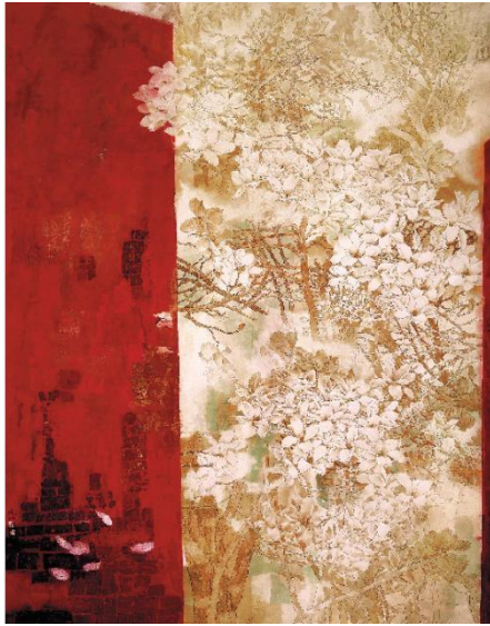
Figure 3. Mo Xiaosong "Spring on the Red Wall"

Take Mo Xiaosong's "Spring on the Red Wall" in Picture 3 as an example to analyze the composition factors in the picture. The plane is the background, making the visual image neat and presenting a harmonious and holistic visual effect. This work not only retains the traditional lush petals of Chinese bird and flower painting, highlights the theme and a clear center, but also uses one-third of the picture to form a sharp contrast between red and white flowers, creating a huge sense of space on the plane and enhancing the viewer's visual memory.