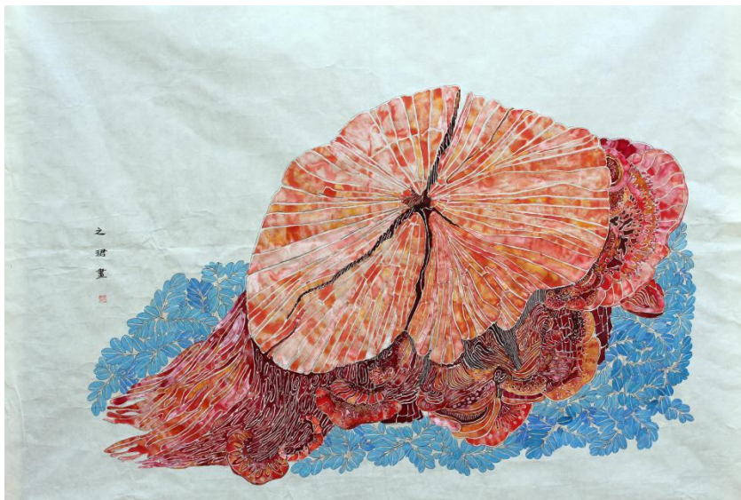
Figure 6. Zhu Zhijun's "Stump" 120x80cm

When finishing the line draft, I turned to draw a small colored draft. For the main part of the stump, after considering the chromatic color and yellow, I finally chose red. It is because I have a preference for red during my growing up. Moreover, I also want to show my passionate and independent spirit and subjective consciousness through this infectious color. To avoid the vulgarity of a large area of bright red, I used the division of color block in the design, which