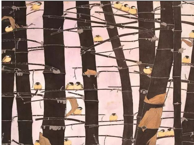
Figure 1. Lin Ruoxi's "Rest" ink and color on paper 490x484cm

painting, the trunk of the thick straight line extends from the top down, the twigs of bamboo develop horizontally, and there are small birds with different expressions gathered together in a point-like shape. With those compositions, the whole picture is balanced, showing various forms of changing relationships.